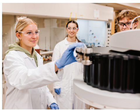
Explore Courses of Study and More